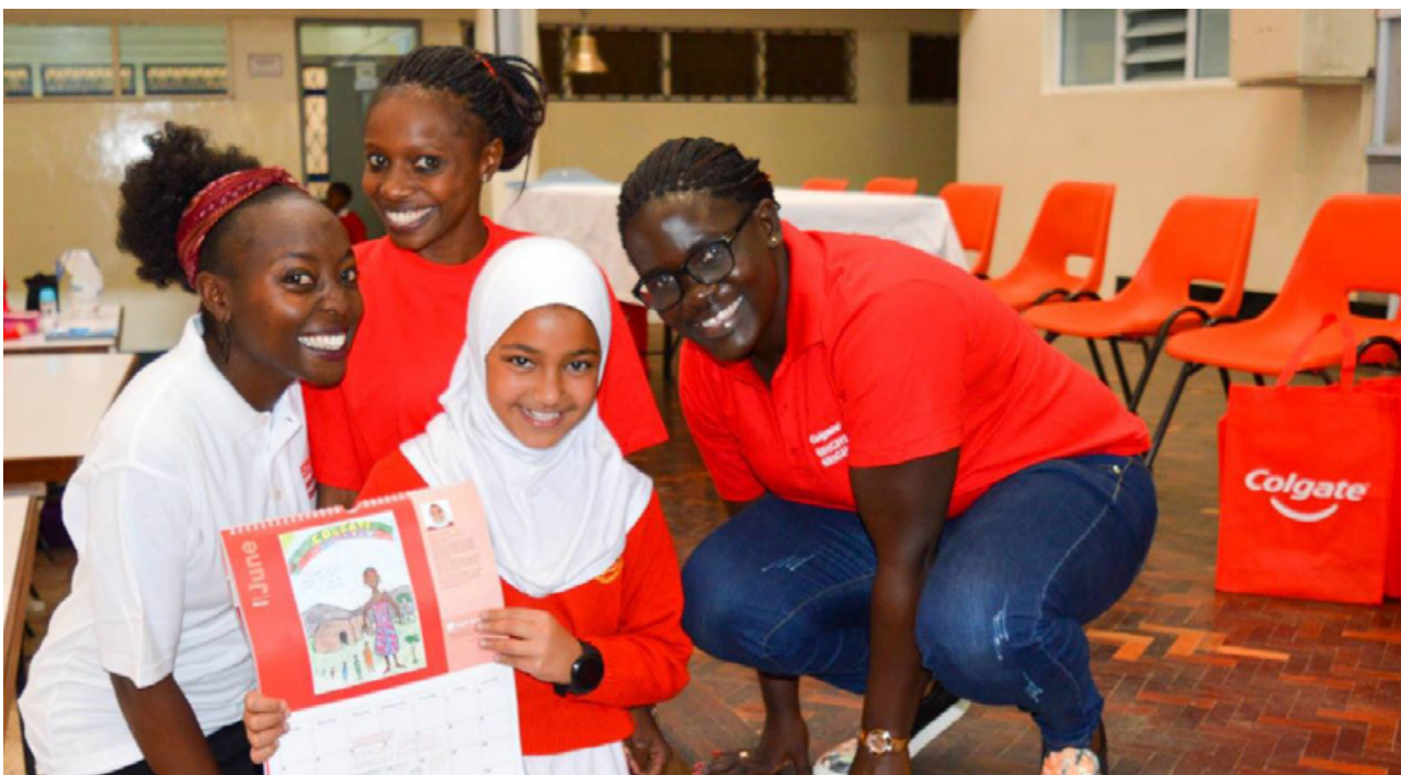
COLGATE PRESENTATIONS AT SCHOOL PROGRAMS

All the participants were given at least one toothbrush and toothpaste and given a teaching lesson on how to brush and keep their teeth clean and healthy.