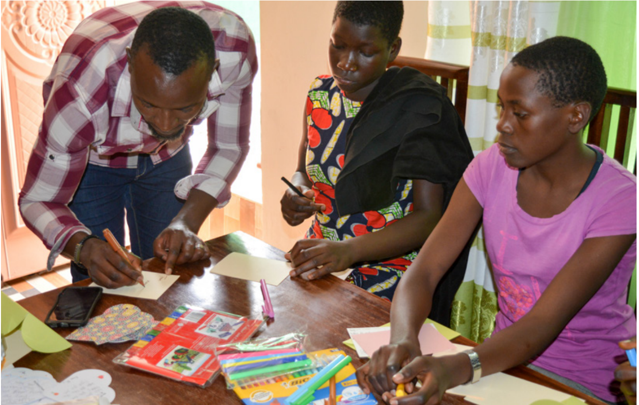
CHILDREN WRITING CARDS