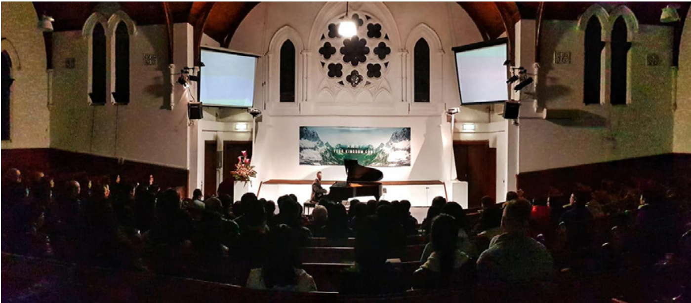
TIMOTHY'S PIANO RECITAL