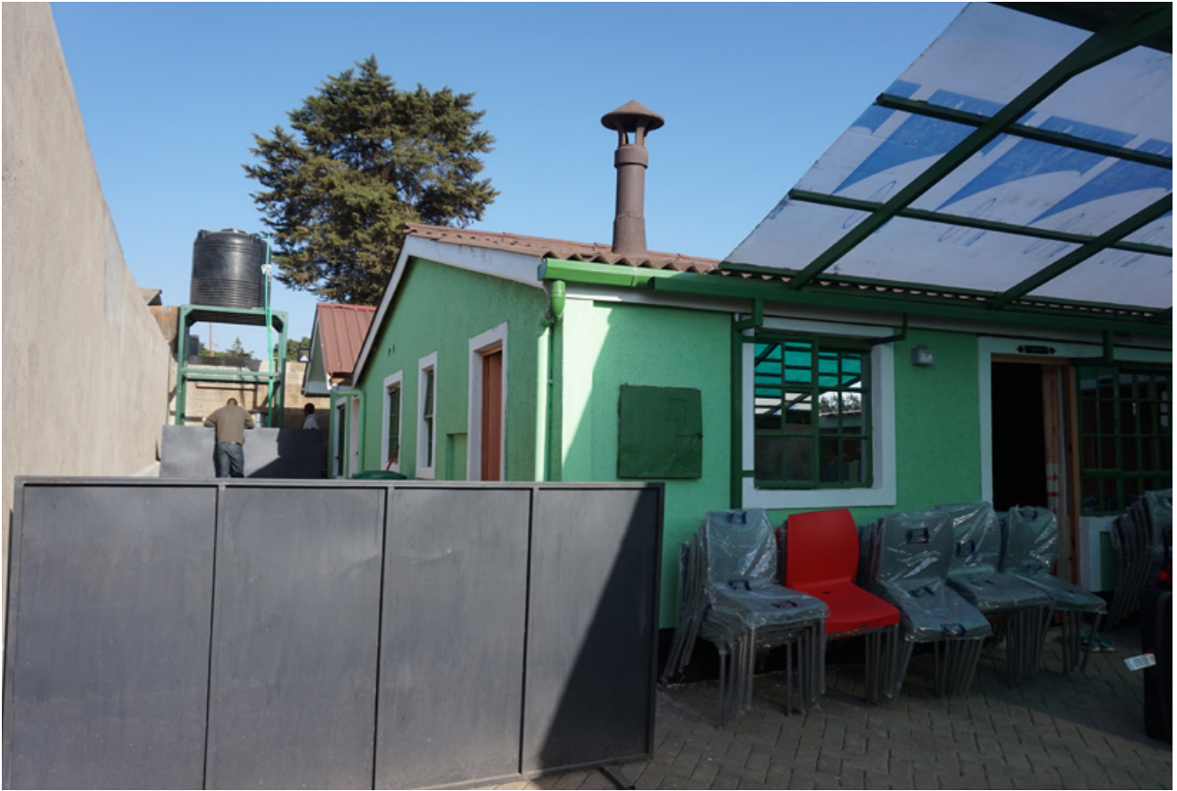
SPUR COMMUNITY CENTER