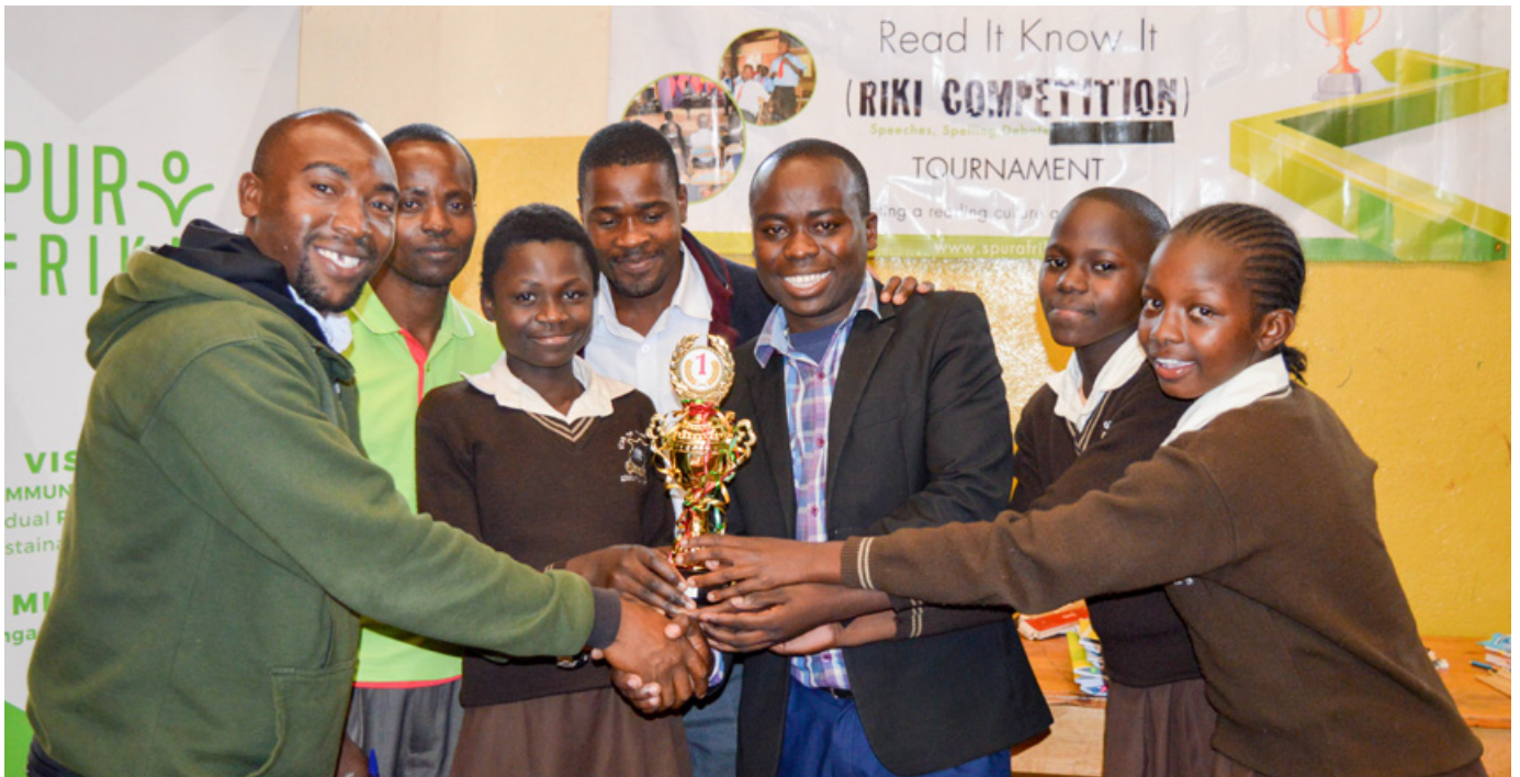
READ IT KNOW IT EVENT

held amongst participating schools in Kibera and the winner school gets to keep a Spur Trophy for a school term. This year the Program has had 8 schools with a total of 470 participating pupils.