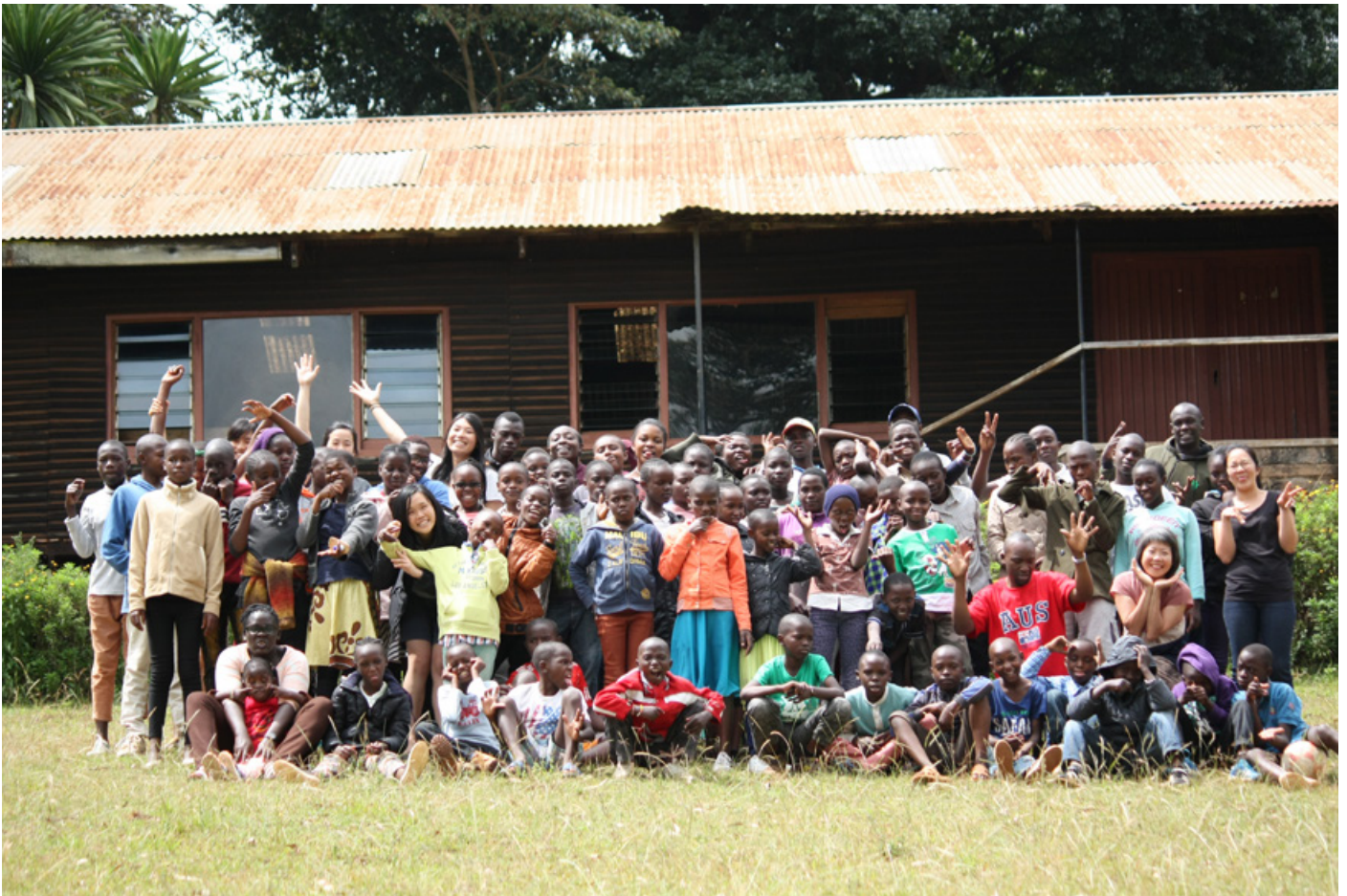
SPONSOR CHILDRENN AT JANUARY 2018 CAMP

2. Pursue avenues to build sustainability for the changes we are advocating for in the community. We are grateful for how far we have come, and we continue to thank God for his great blessings and favor upon us. The gift of partnership with Spur Afrika Australia has made that possible.