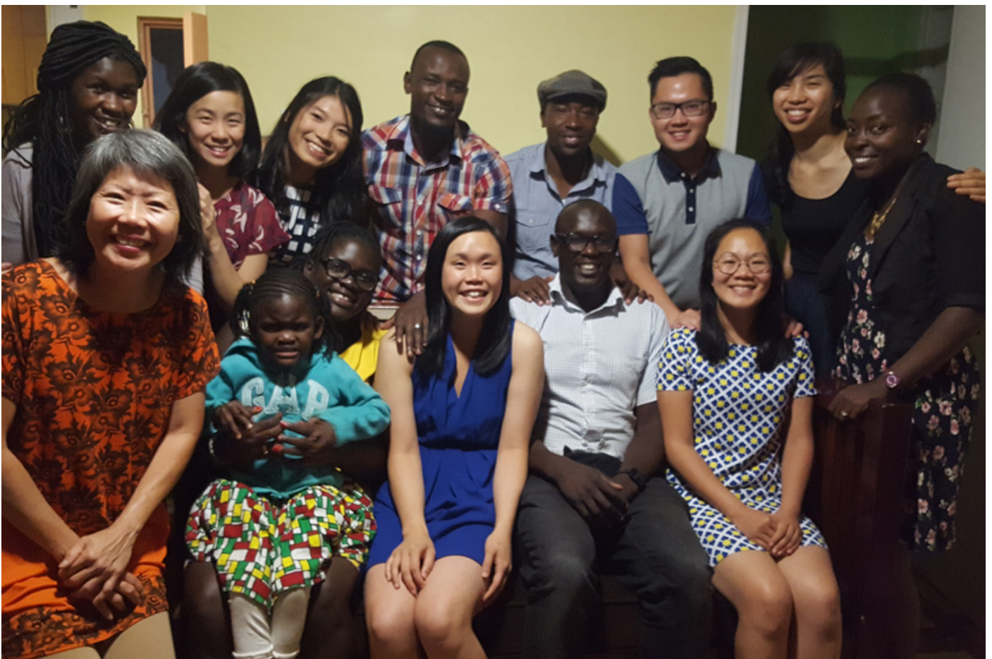
MISSION TEAM 2018

Finally, thank you for choosing to partner with Spur Afrika. We pray, hope and look forward to your continued support. We look forward to sharing the news about our plans for 2019. Whilst, the new year will bring many challenges, we are looking forward to raising funds to sponsor more children and change more lives. We hope you will continue to put your trust in us. Thank you!