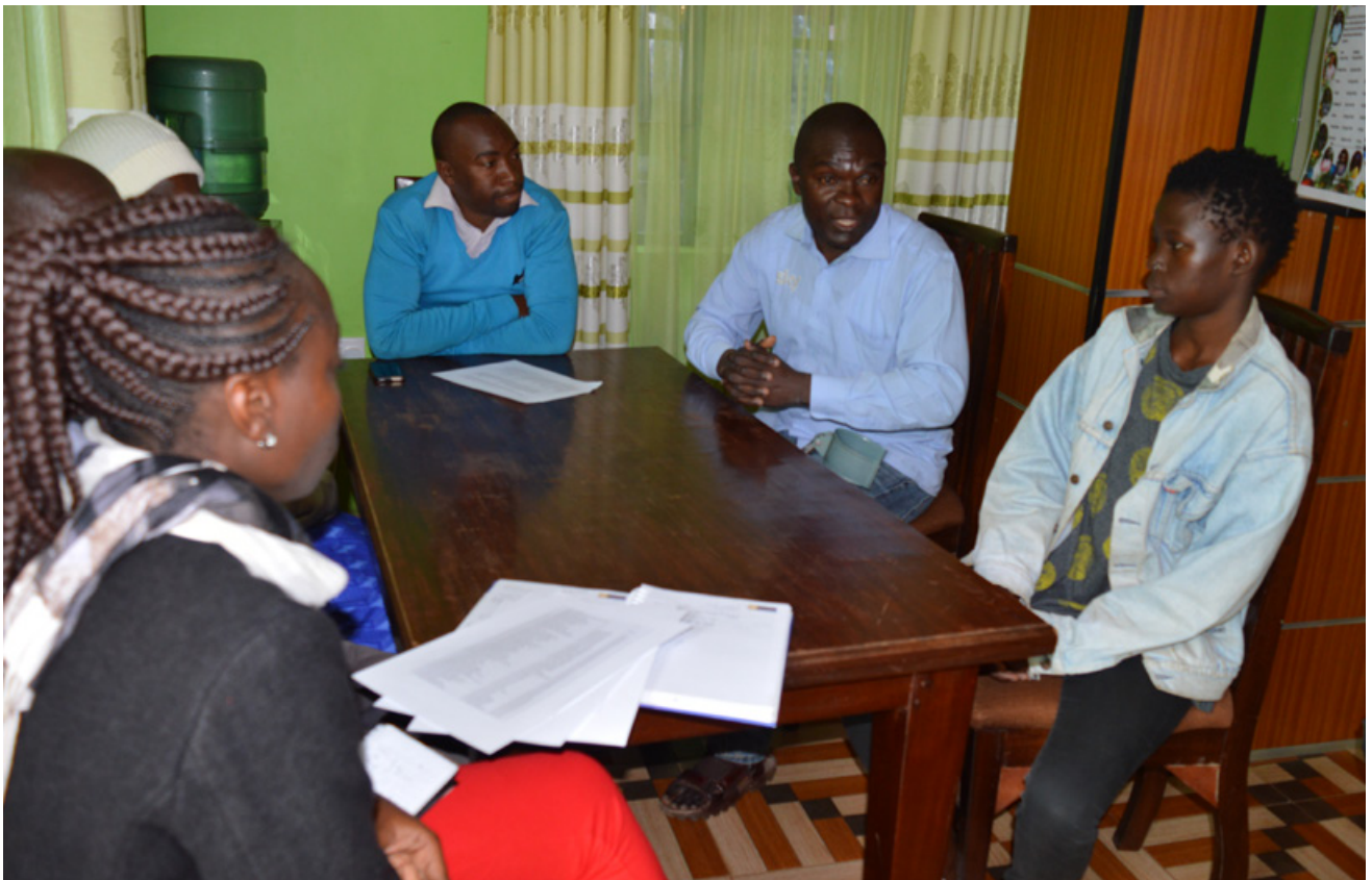
NHIF PARENTS MEETING